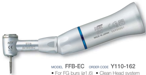
MODEL FFB-EC ORDER CODE Y110-162 • For FG burs (ø1.6) • Clean Head system • Ultra Push Chuck