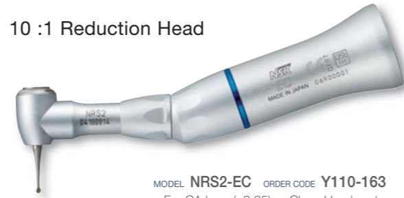
MODEL NRS2-EC ORDER CODE Y110-163 • For CA burs (ø2.35) • Clean Head system • Push Button Chuck